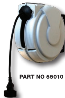
PART NO 55010